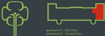
Apartment 5 - First Floor Apartment 9 - Second Floor